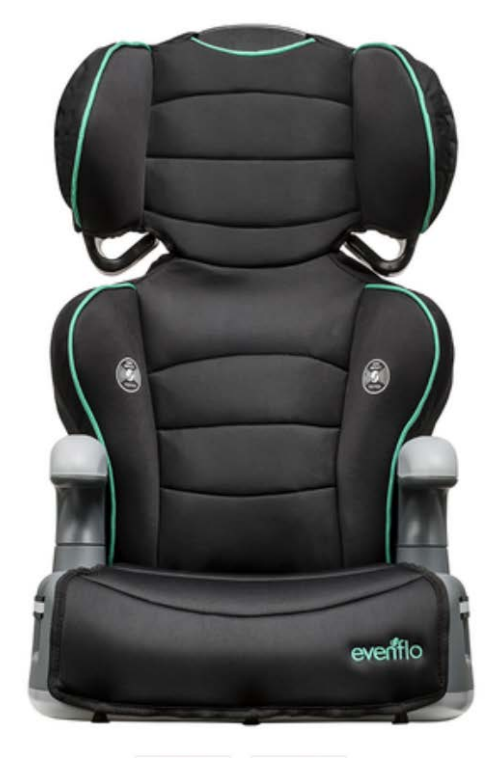
Car Seats / Booster / Big Kid Booster Car Seat